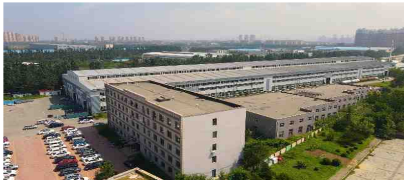
No. 2 Factory: Centrifuge & Separator Manufacture