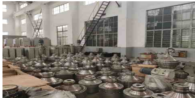
Semi finished product area