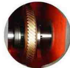
铜齿 Copper Gear