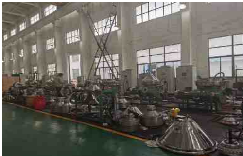
Product test area