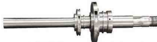
大小向心泵 Large and Small Centripetal Pump