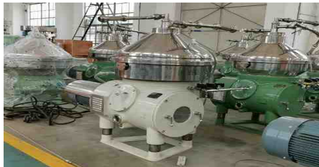
Warehouse & Stock