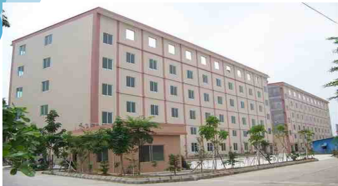
No. 1 Factory: Headquarter Office